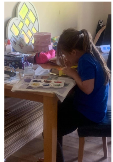
Painting the space rocket

Please pray for the 70-80 families receiving these bags.